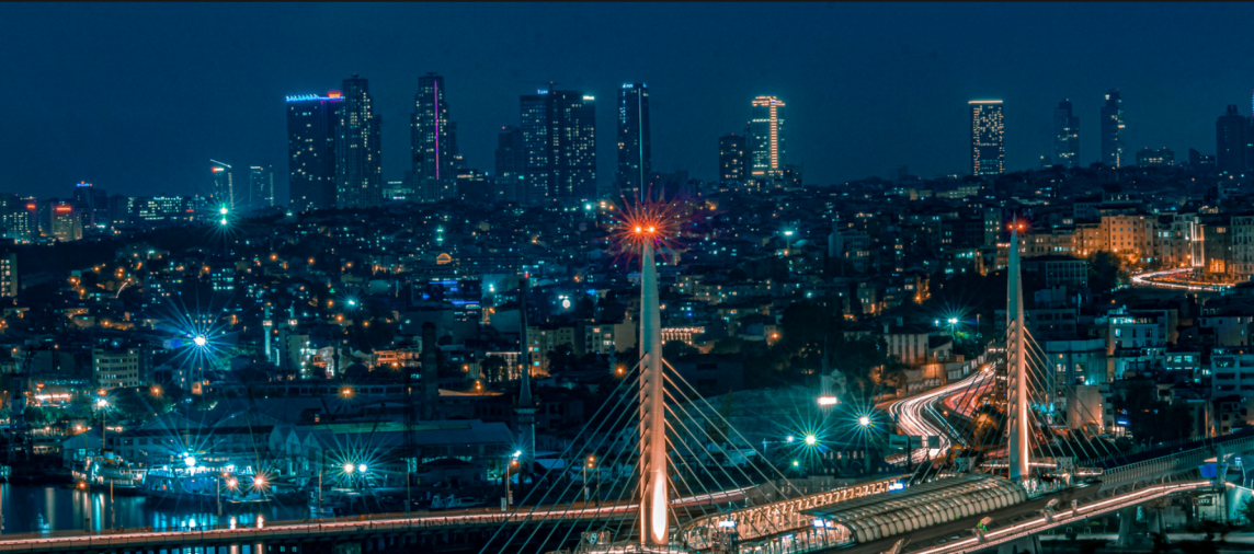
Rachelle Beaudry Mint Capital Investment